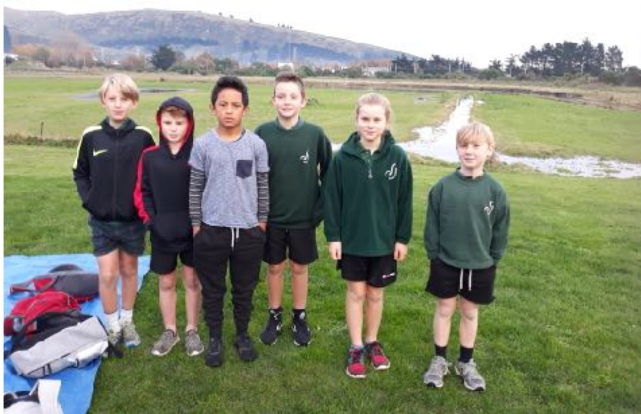
Cross country team representing Bromley School